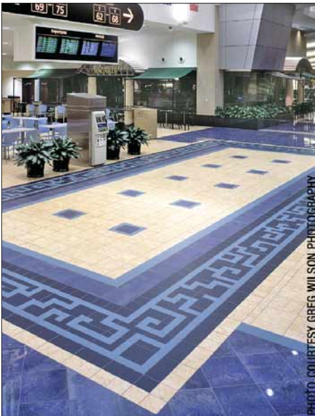
Lifetime fracture-free performance warranty with full floor coverage

and must meet live or dead load subfloor deflection requirement 1/360 for ceramic and porcelain tile or 1/720 for stone and tile. The surface must not exceed the maximum variation of 1/4" in 10' (6.4 mm in 3.1 m) from the required plane.